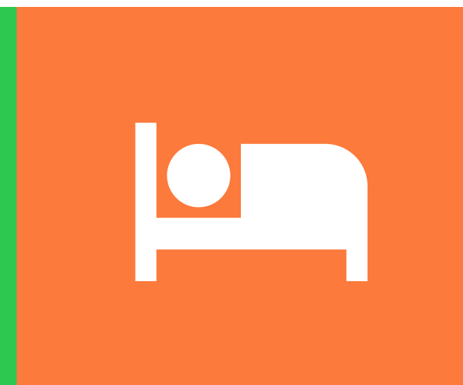
Hotels & Spas