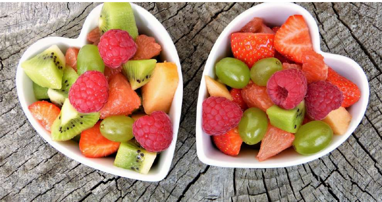
Fresh fruit at the office