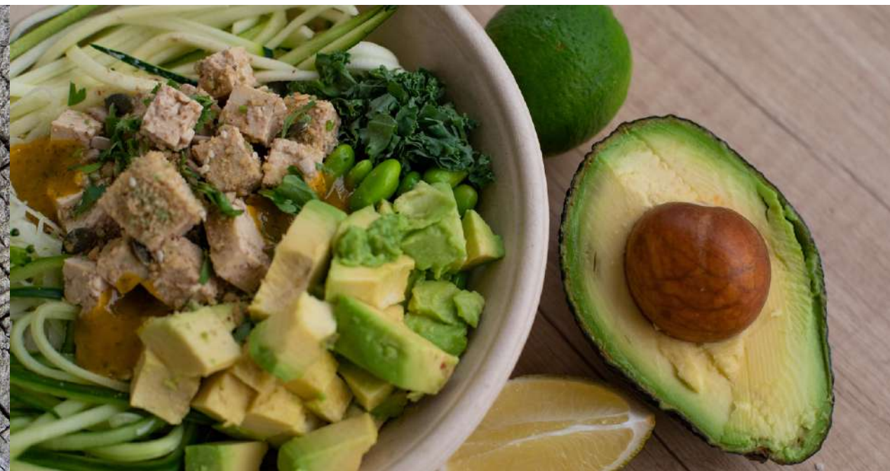
Fully equipped meal areas