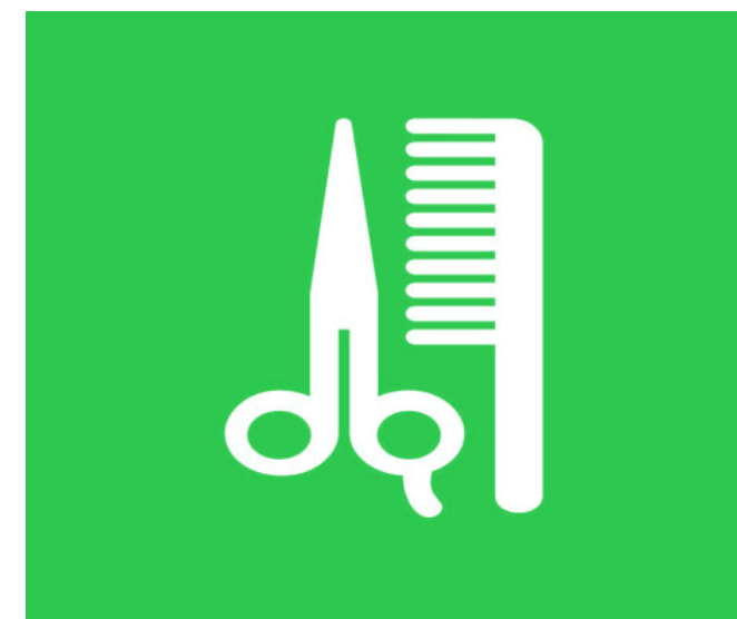
Beauty & Styling